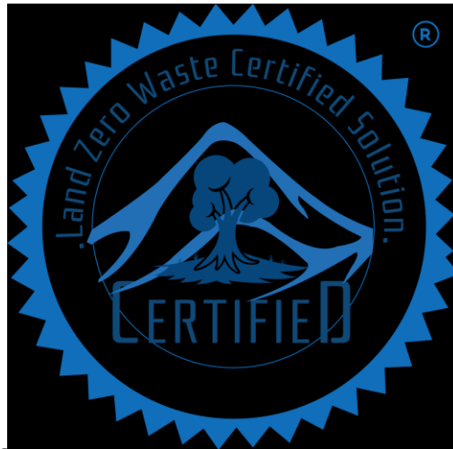
Landfill Zero Waste Certified® So-