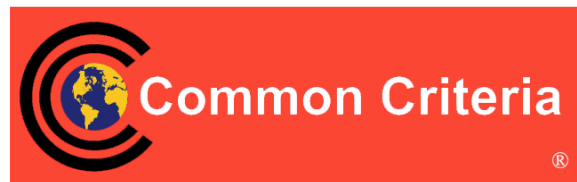
Figure 6: Recognition Arrangement Service Mark

The service mark of this Recognition Arrangement, which is shown in Figure 6 below, is to be used to identify, advertise and market services which are performed by a Participant (or Compliant CBs) in conjunction with this Arrangement.